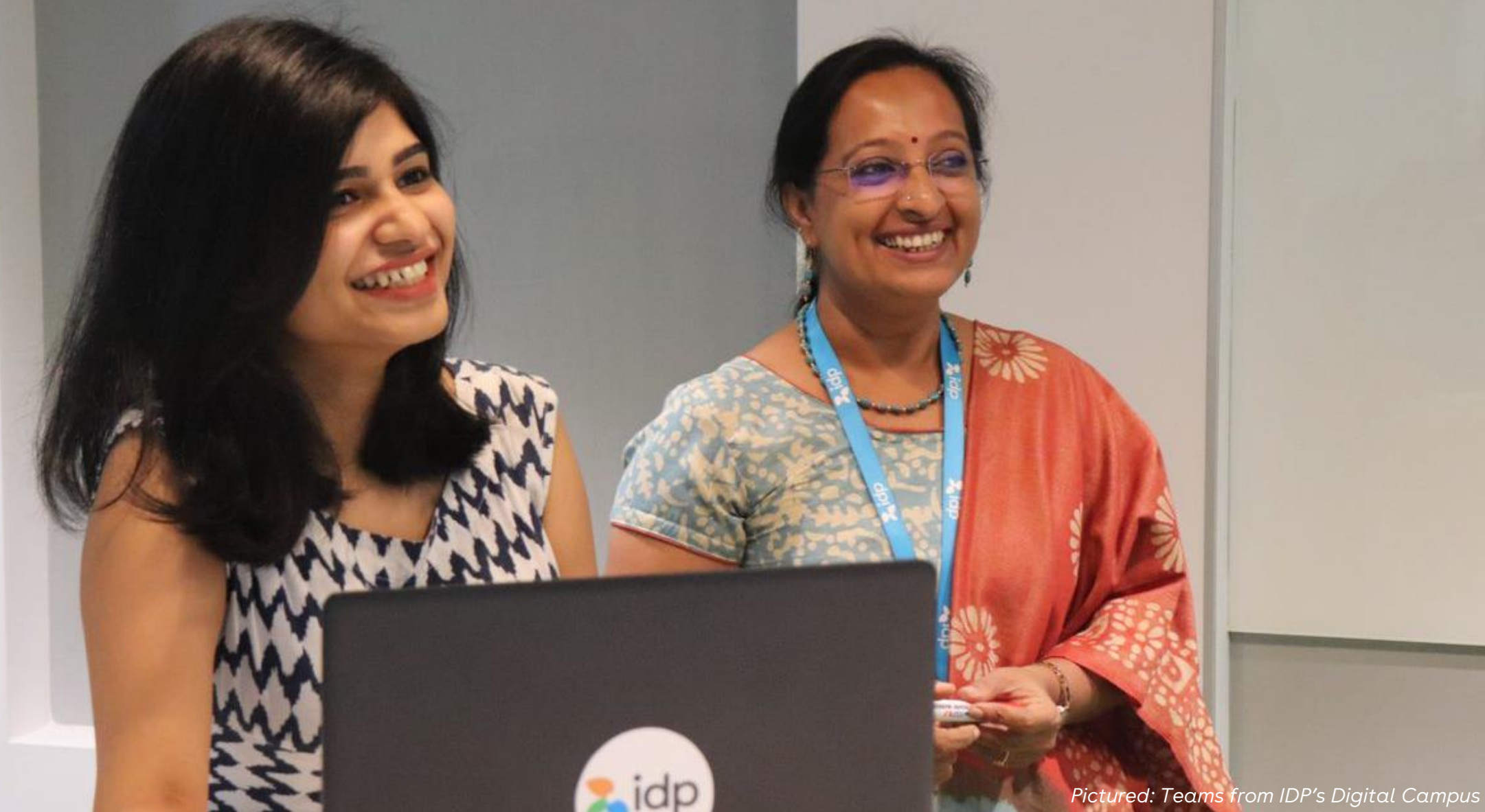
Pictured: Teams from IDP's Digital Campus

IDP Education Half Year Financial Results Six Months to 31 December 2019