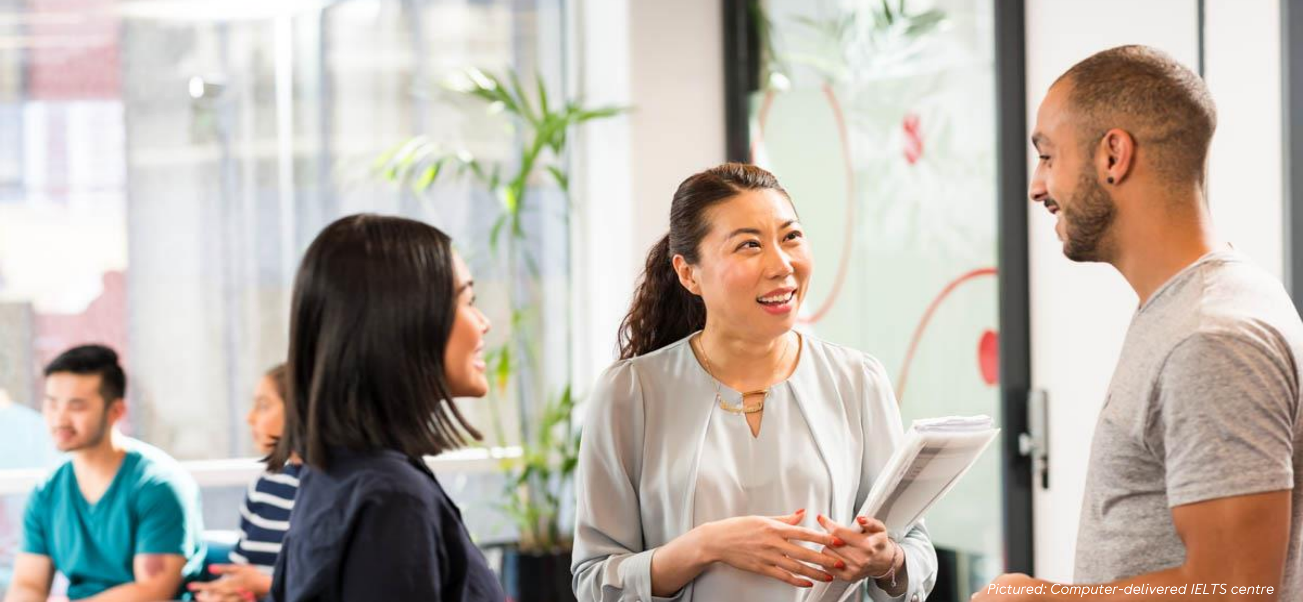
Pictured: Computer-delivered IELTS centre