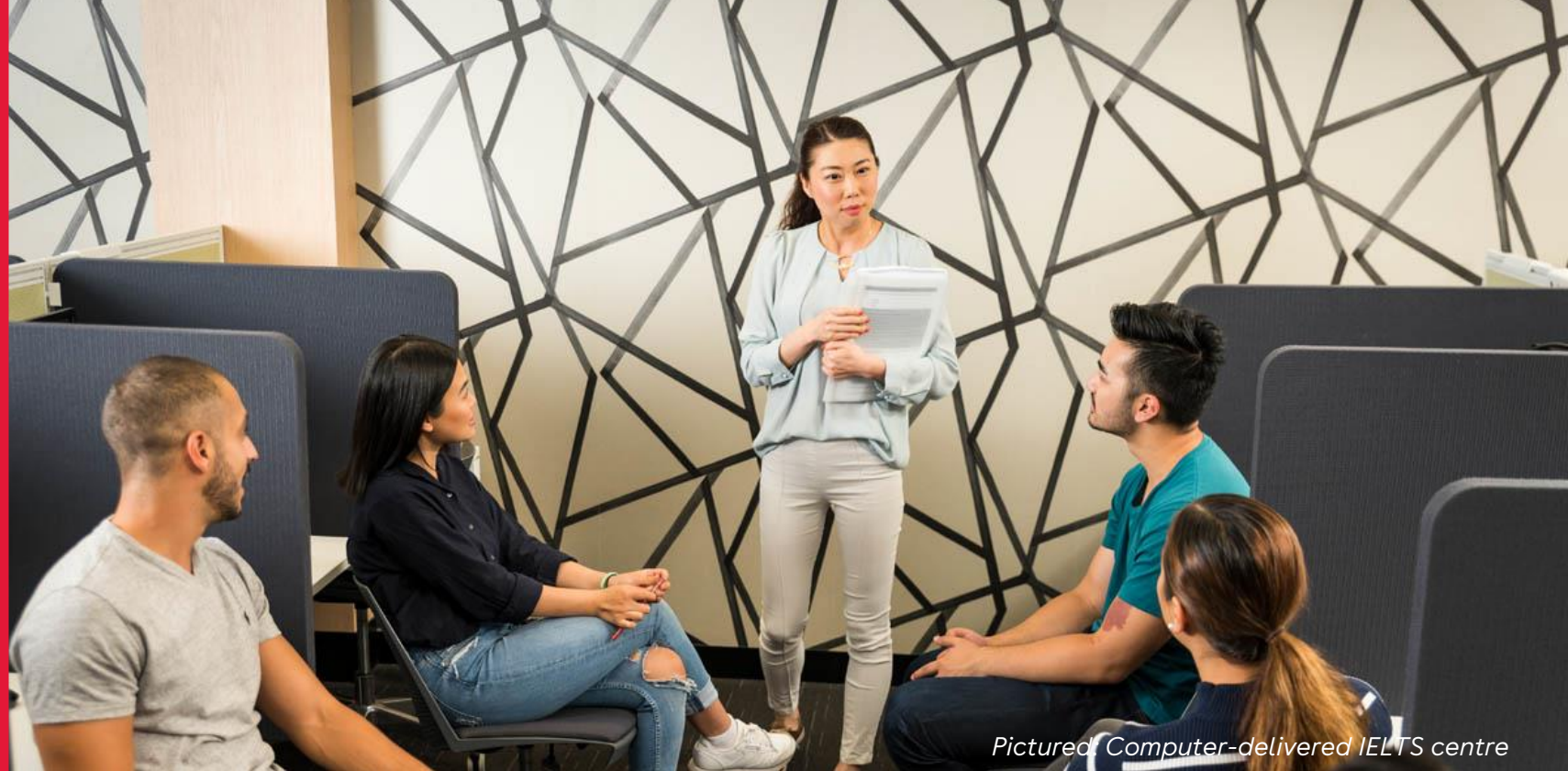
Pictured: Computer-delivered IELTS centre