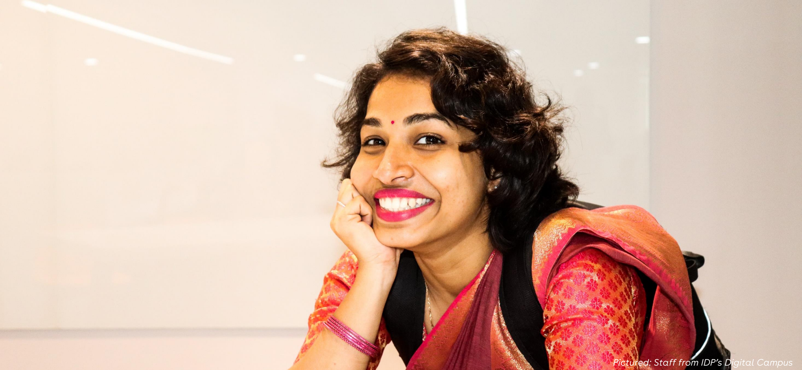
Pictured: Staff from IDP's Digital Campus